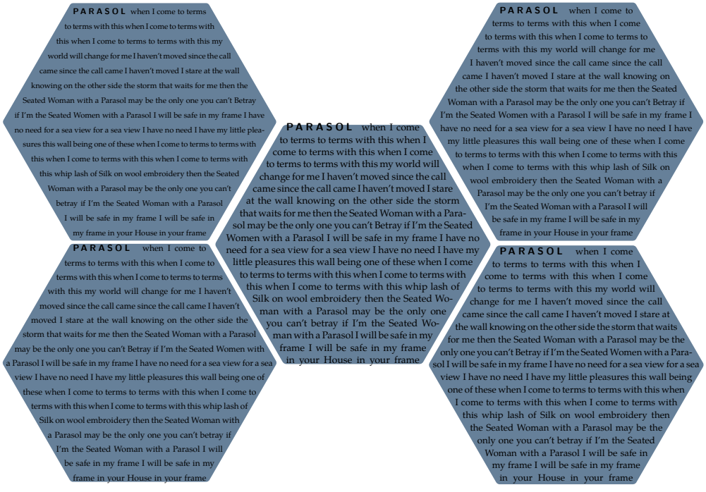
Figure 2 Parasol