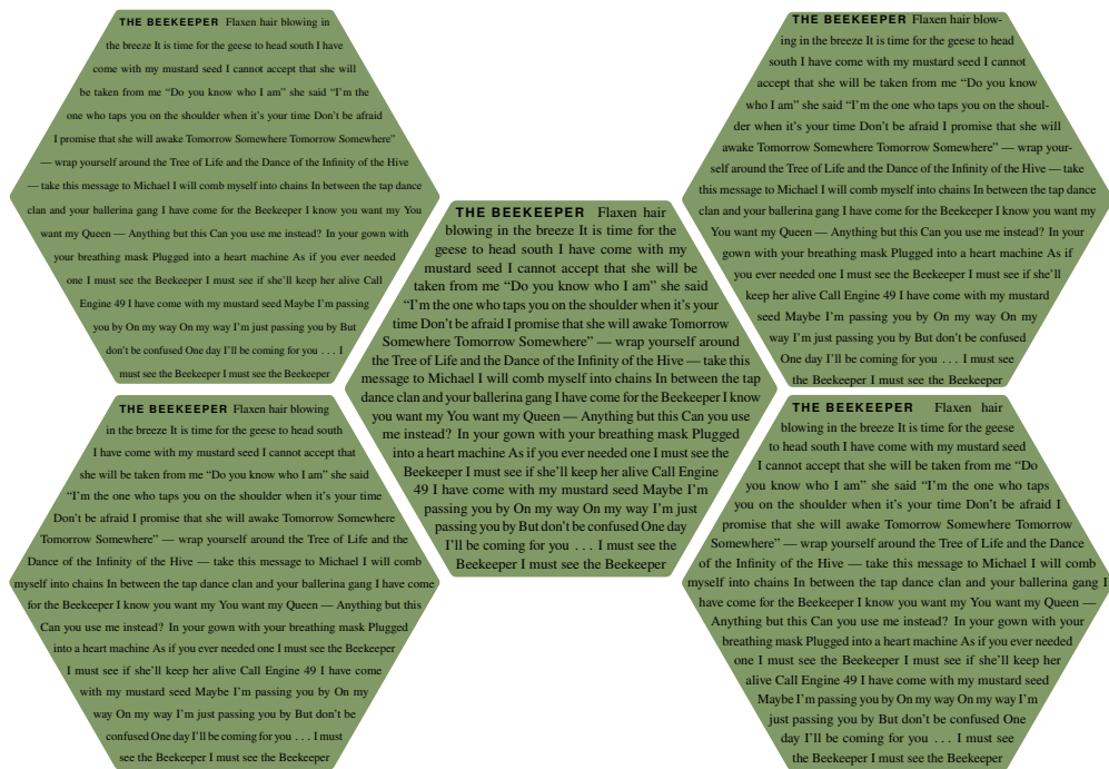
Figure 2 The Beekeeper