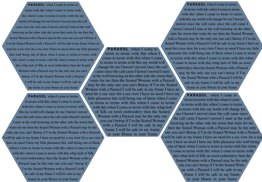
Figure 1 Parasol